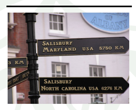
Signs in Salisbury, UK

As we continue to expand our presence in the community, I would like to see some public recognition of our sister cities, perhaps as a part of the revitalization of the City of Salisbury.