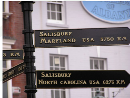
Signs in Salisbury, UK

As we continue to expand our presence in the community, I would like to see some public recognition of our sister cities, perhaps as a part of the revitalization of the City of Salisbury.