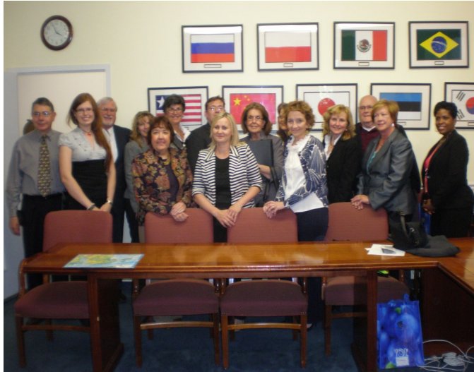
Photo before the Maryland International Consortium inaugural assembly meeting

samples. Several volunteer students invited me to an Estonian concert to be held at George Washington University the following week. If I lived near Washington, I would partake in the concert as well as embassy sponsored events throughout the year! I hope to have the opportunity to thank faculty and administrators at the University of Tartu for providing my daughter with an authentic international education. We will visit the Tallinn Christmas Markets and attend the Holiday Music Festival. Reflecting upon all the wonderful Estonian friends whom I have met over the past two years, I am certain that my first visit to Estonia will be among the most memorable experiences of my lifetime!